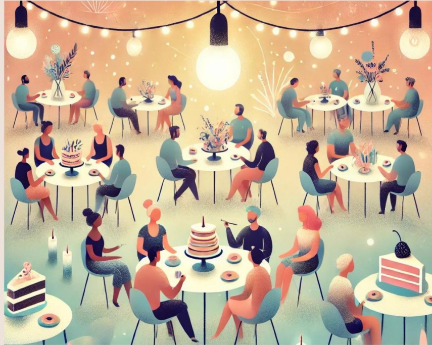
TABLE TALKS ALDERGROVE

SUBSTANCE USE & YOUR NEIGHBOURHOOD A DESSERT & DIALOGUE EVENING