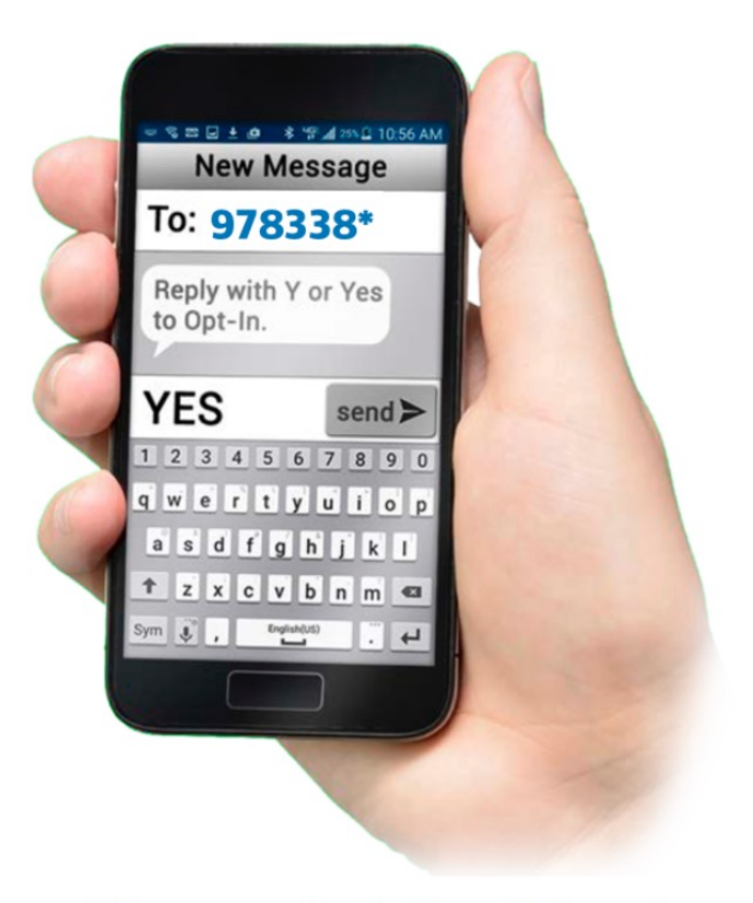
*if your number is Canada-based.

You can also opt out of these messages at any time by simply replying to one of our messages with " Stop ".